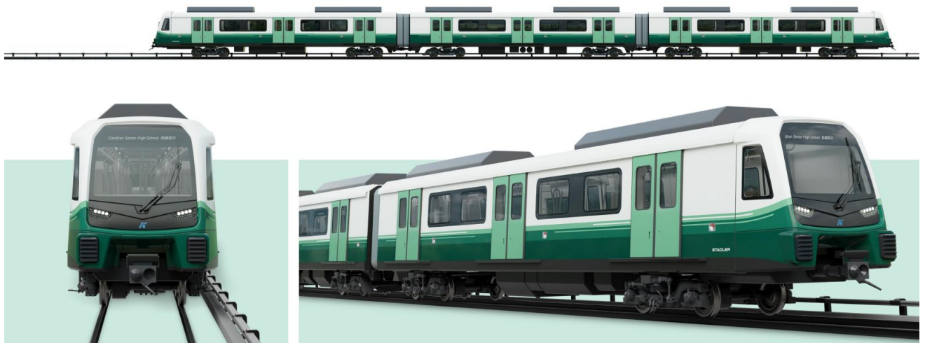
Figure 1: Exterior Trainset Design Representation

As it contains technical requirements on a general basis, this document is only exhaustive in combination with additional system-specific specifications and other documents. So, for designing systems and components for this project, detailed system-specific requirements have to be met too.